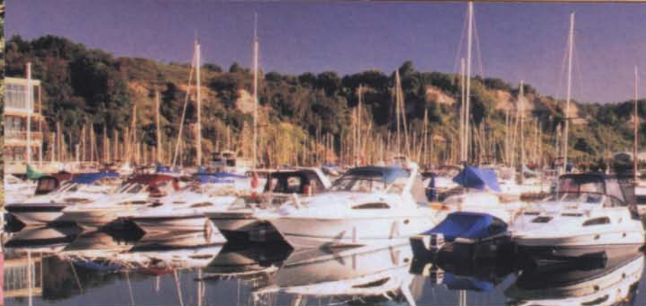
Left: Scenic Tam O'Shanter golf course; middle: a ruin that's romantic makes a lovely spot for an open air concert at the Guild Inn; right: the marina at Bluffers Park.

Rouge Park, a leader in environmental protection, boasts 5,400 acres of conservation wilderness and is the largest park within a North American city. On a sunny weekend, what could be more peaceful than exploring nature trails or going fishing in the valley? A brief escape for body and soul.